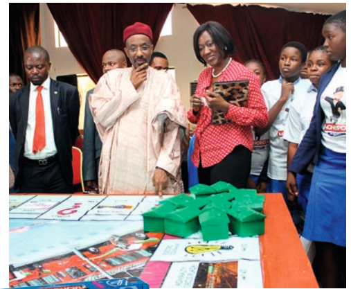
Get Onboard Bestman Games is putting Lagos on the Monopoly map